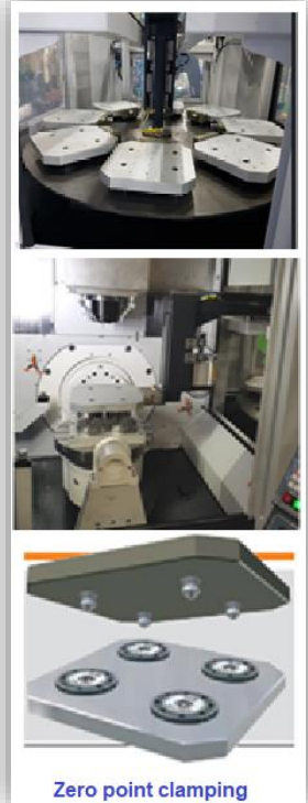
Zero point clamping